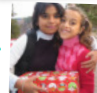
Distributed to children & families in SE Europe