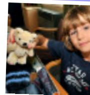
Enjoy packing your shoebox