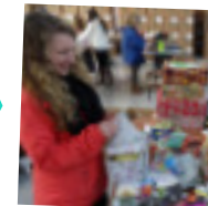
Volunteers sort & pack the boxes