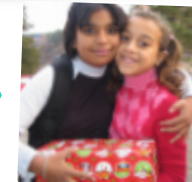
Distributed to children & families in SE Europe