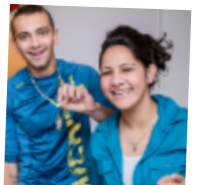
Impact on our long-term projects