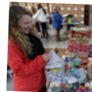
Volunteers sort & pack the boxes