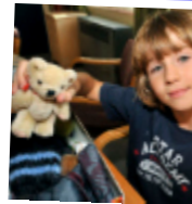
Enjoy packing your shoebox